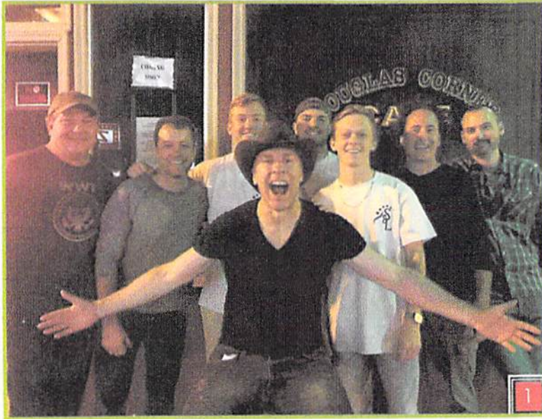
Whiskey Trippers and Springboard Volunteers