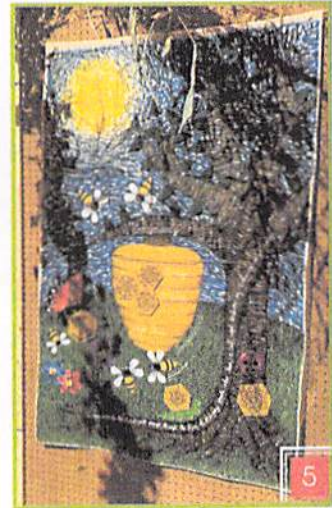
"Repairing the World" by Alyssa Fosnight